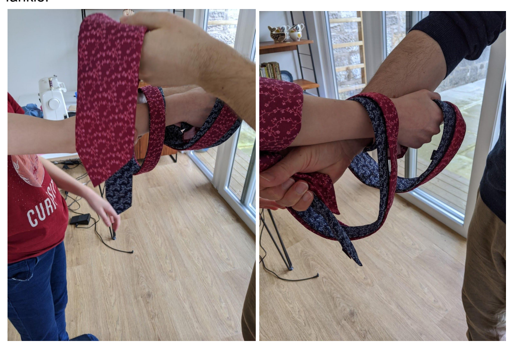
Repeat if you can. When you've run out of material to loop, P2 takes the loose ends and holds on tight (in the hand next to P1's elbow)