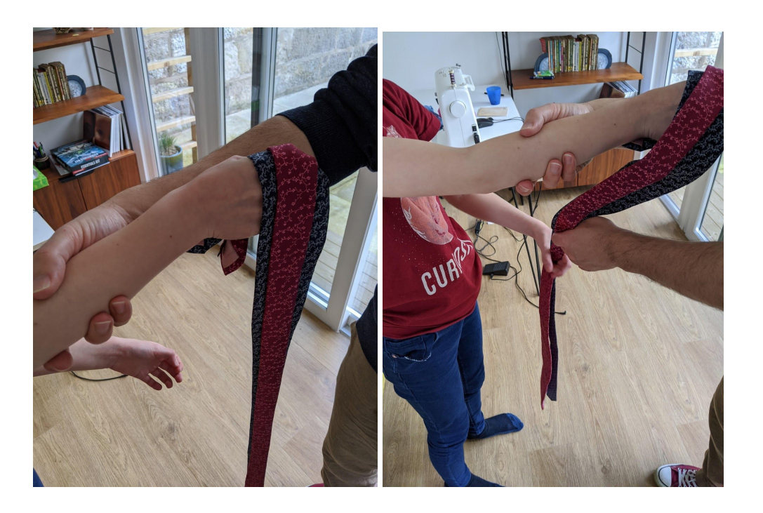
P2, take the loose ends in your free hand and pass them over your joined arms to P1. Loop the material loosely. This is important. If your loops are too tight, you'll end up in a right fankle.